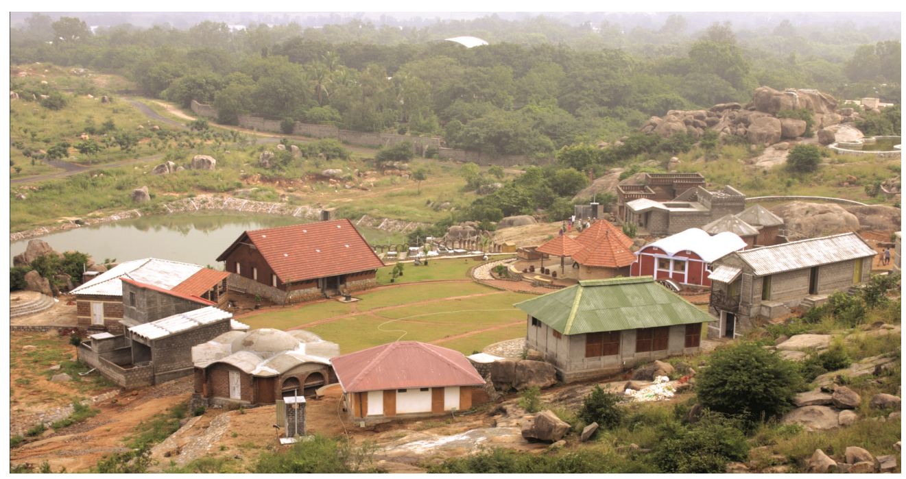
An aerial view of RTP, NIRDPR

at the RTP. For this purpose, NIRDPR has developed a unique partnership approach with dynamic technology development agencies, entrepreneurs and non-governmental organisations for realising this objective. As part of this important activity, NIRDPR has been identifying appropriate and pathbreaking innovations being developed by R&D institutions which can be utilised promote entrepreneurship and sustainable livelihood for the benefit of people from rural areas. Over 20 technology units have been established providing entrepreneurship development training programmes, and discussions with numerous potential agencies are being carried out. In addition, recently, the Career-cum-Guidance Centre of CAPART in Vaishali has been taken over by RTP, NIRDPR and training programmes have been initiated.