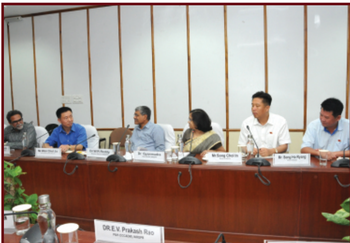
Korean Delegation Visits NIRD&PR