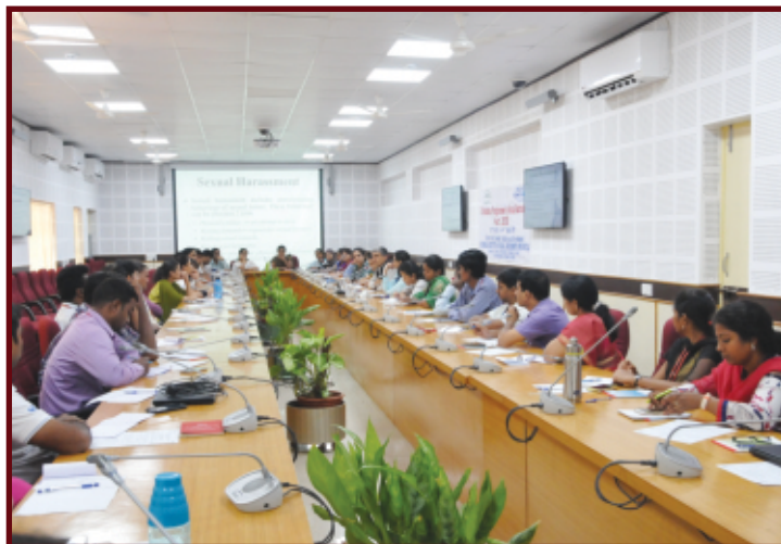
Orientation on Sexual Harassment Act