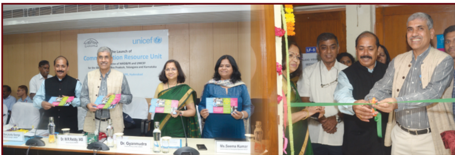
Launch of UNICEF and NIRD&PR Communication Resource Centre