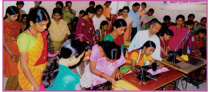
Participants of Tailoring & Fashion Designing at work