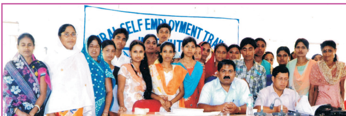
Participants with faculties at an entrepreneurship awareness programme