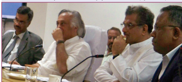
Hon'ble Minister of RD Shri Jairam Ramesh addressing NACR