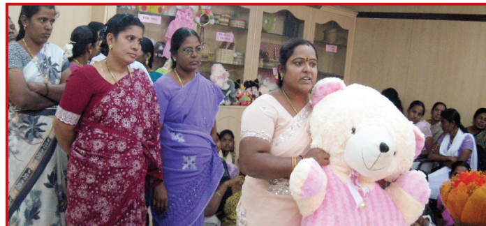
Ex trainees of IND RSETI Vellore showing their product